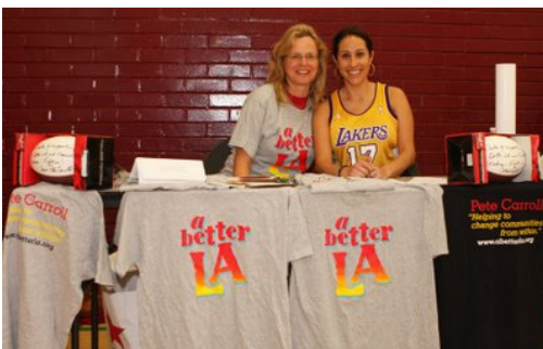
A Better LA volunteers at the Marshall Madness 3 on 3 Basketball Tournament

It is exciting to receive support and understanding from the great business leaders of the future, and consider how they can continue to make a difference in their efforts of collaboration with A Better LA.