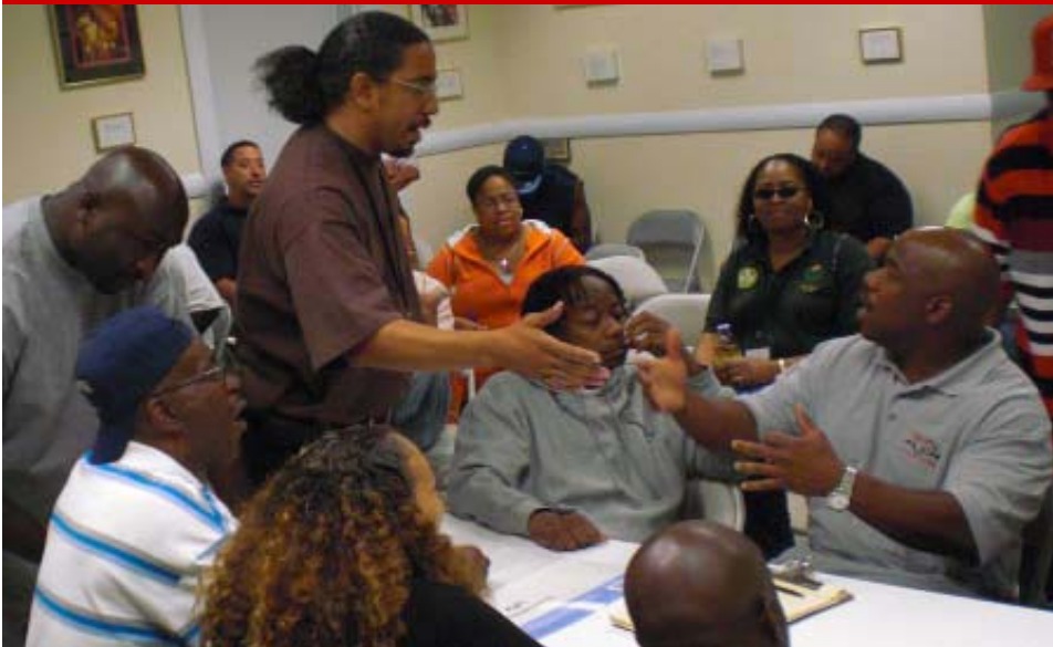
(left) Outreach Workers engage in an exercise in the initial course of PCITI.