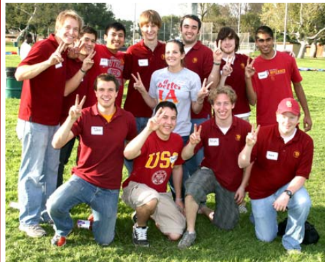
USC's Trojan Knights and A Better LA volunteers at Family Day in Athens Park