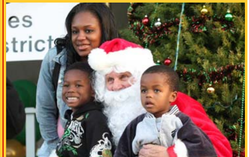
Children celebrating Christmas with Santa Claus in Helen Keller Park