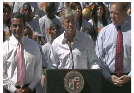
Mayor Antonio Villaraigosa, USC's Pete Carroll, and GRYD's Jeff Carr

SNL will continue to be critical to the safety of our communities. At this time, all adolescents throughout the City of Los Angeles will be out of school during the summer months, searching for activities to cure restlessness and boredom. Over the next three years, we must strategically plan to fill these gaps in services during the summer months – and the SNL model is ideal to engage high numbers of youth in at-risk communities. As one neighborhood youth said, "You cannot stabilize our communities by reducing violence; you reduce violence by stabilizing our communities."