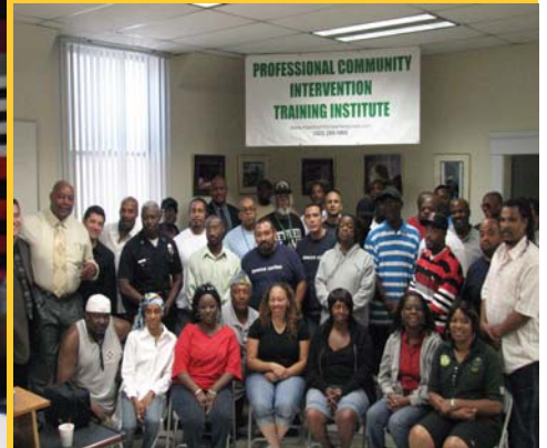
One of our proud graduating classes!

One of A Better LA's most innovative tactics is to fund intervention or "outreach" workers to combat violence in Los Angeles. Outreach workers prove to be effective as they are residents in the communities in which they work, and have a passion for bringing much needed stability to the neighborhood.