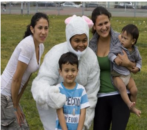
A family interacting with the Easter Bunny at Queen Anne's Recreation Center on Easter Sunday

In every area that Unity One has worked, homicides and shootings are on the decline. Unity One is dedicated to cleaning up the community, which can be seen in its role in transforming one of the neighborhood parks from being violence and drug infested into a thriving community space, filled with children and families.