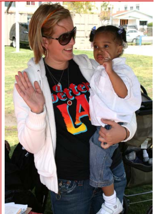
A Better LA volunteer and a friend having a good time at the Easter Egg Hunt

A Better LA partnered with A Foundation For Kids who provided the food, games, crafts, and bounce houses. This incredible event was made possible by A Better LA volunteers who carry and are committed to Pete Carroll's philosophy of doing things better than they have ever been done before, looking to improve all facets of the event, constantly ensuring a positive and enjoyable experience for community families.