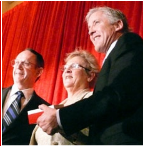
Pete Carroll receiving the Crystal Heart at USC's School of Social Work

Proceeds from the evening helped establish the "Pete Carroll Scholarship" for students pursuing graduate study at the USC School of Social Work.